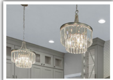
LIGHTING, AND MORE!

*Promotional offer limited to one per household. Scratch off card must be redeemed with an executed agreement of sale on/ before 5 p.m. Thursday, October 31, 2019. Offer applies to Design Gallery Options only - no substitutions. Offer does not apply to Quick Move-in Homes or homes under contract before Sunday, August 31, 2019. Offer cannot be used in conjunction with any other promotion or incentive. Buyer must use Landmark Homes' 'Financial Resources' for mortgage and title work to be eligible for the promotional offer (cash agreements exempt from mortgage stipulation). Other terms and conditions may apply, see Community Sales Manager for details.