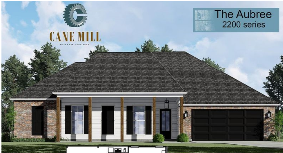
The Aubree 2200 series

4 Beds | 3 Baths | 2 Car Garage 2,252 Lvg Area | 1 Story | Starting from $332,000